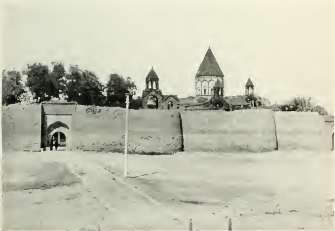
MONASTERY AT ETCHMIADZIN